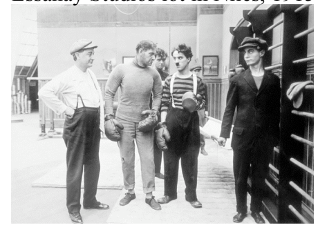
"The Champion" filmed in the Essanay Studios lot in Niles, 1915

11:00 a.m. – 4:00 p.m. in Old Town Niles